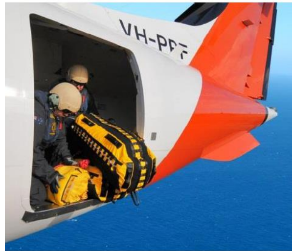
Dropping of SAR equipment from cargo door

All five aircraft are equipped with a comprehensive suite of surveillance sensors and a mission system – AeroMission – integrating the information of all sensors. The aircraft are fitted with conformal observation windows and can carry search and rescue equipment of up to 1000 lbs. The use of the modified cargo door for dropping of SAR equipment provides unique dropping capabilities. Further, the aircraft is certified for parachute jumps from the In-Flight-Operable-Door.