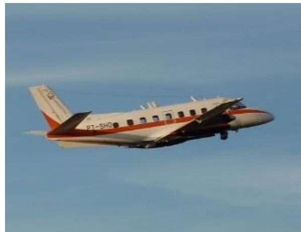
Pollution surveillance aircraft in flight

All of the above-mentioned information is made available in real-time during the flight via the comprehensive communication suite. This enables the operator to continuously report e.g. to the Emergency Situation Centre to support the decision making process with the most actual data and to the ship based reaction forces to improve the oil recovery process.