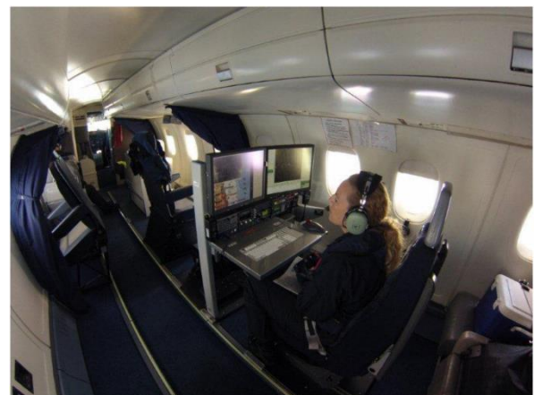
Dornier 328 cabin