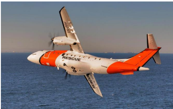
Dornier 328 in SAR configuration

Australia is responsible for 10 per cent of the globe for international maritime and aeronautical search and rescue services and recognized the requirement for a world-class maritime search and rescue capability.