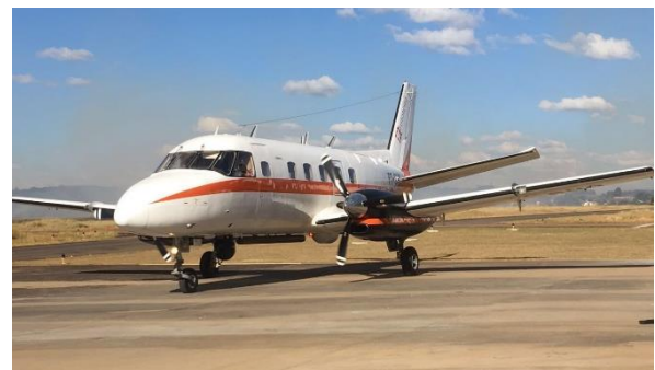
First fully equipped Maritime Oil Pollution Surveillance Aircraft

Aerodata AG and the Brazilian company Fototerra Atividades de Aerolevanteamento Ltda. recently have established a Joint Venture, Fototerra Survey SCP in Brazil. Major target of Fototerra Survey SCP is to provide airborne maritime pollution surveillance services for the private sector as well as for governmental agencies. At the beginning of July, after nearly 18 months of intensive development and production the first fully equipped maritime surveillance aircraft, has been released to service, able to take over environmental surveillance service flights on a 24/7 basis.